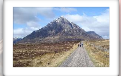
NORTH WALES BRECON BEACONS SCOTTISH HIGHLANDS DARTMOOR THE PEAK DISTRICT