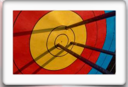
CLIMBING / ARCHERY CANOE EXPEDITIONS FIRST AID NNAS SCHEME THEMED ADVENTURE