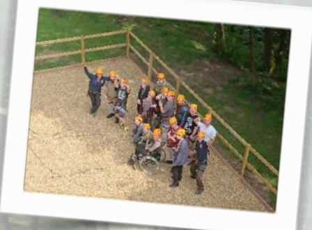
Age: 8 - 15

email for details: bookings@xadventureactivities.co.uk